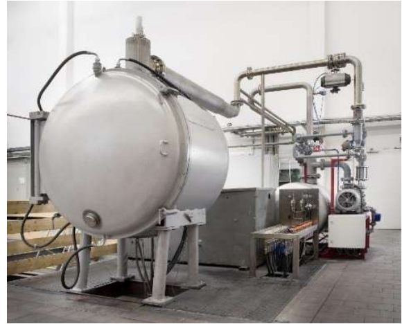
CVI Reaktor @ CVT

eye level between manufacturers and customers on a technical scale.