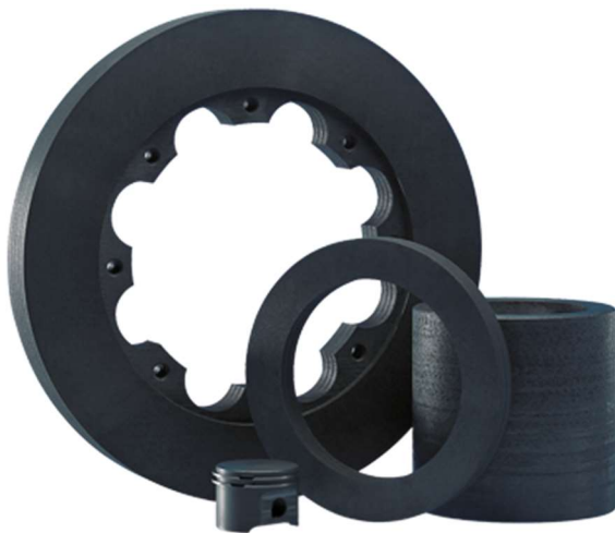
C/C Materials @ CVT